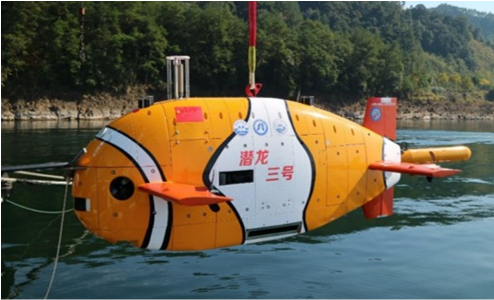
Fig. 1 Qianlong-III AUV