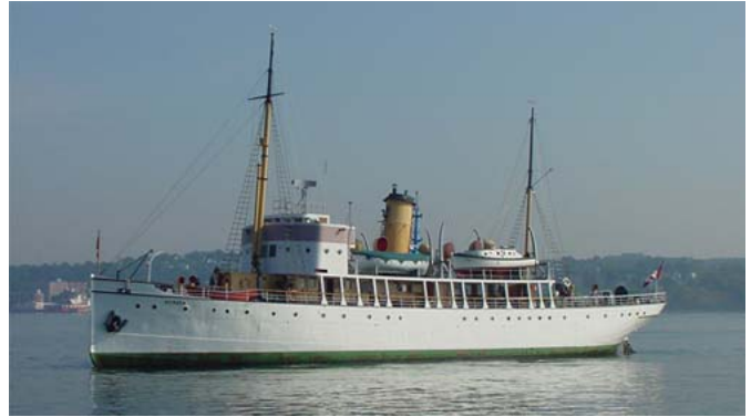
CSS Acadia—Canada's first hydrographic ship